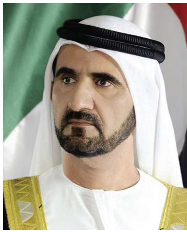
His Highness Sheikh Mohammed Bin Rashid Al Maktoum UAE Vice President, Prime Minister and Ruler of Dubai