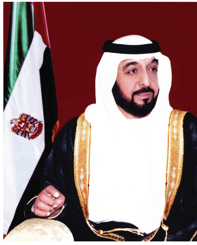
His Highness Sheikh Khalifa Bin Zayed Al Nahyan President of the United Arab Emirates